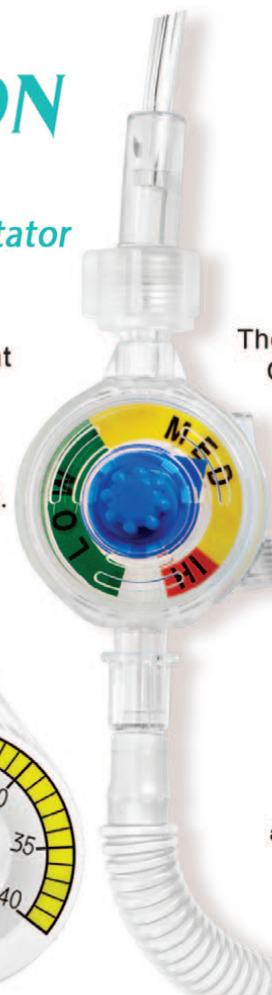
The New Neo-Tee Configuration